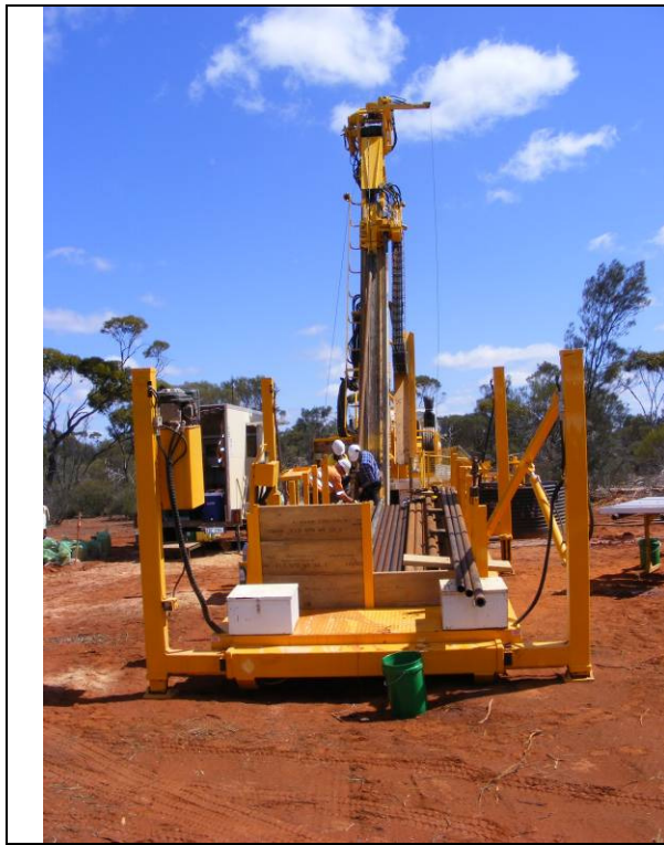
Diamond drilling rig on site at Lignum Dam