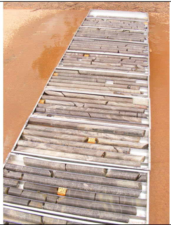
Diamond drill core from the Hughes Prospect, Lignum Dam.